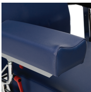
Extra wide armrests