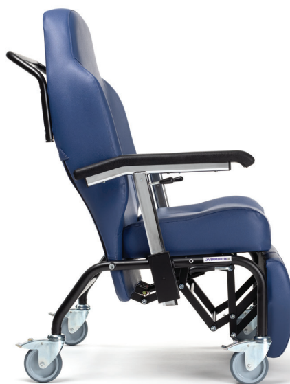
Normandie XXL with wheels

Regarding quality, the Normandie XXL complies with the highest norms, laid down by certified test institutes in most European countries.