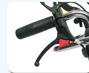
B74 - Drum brakes