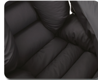
- Seat compartment -