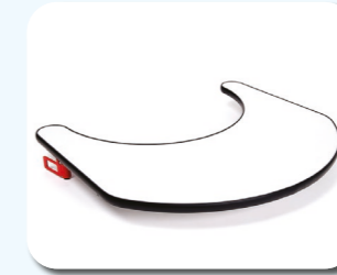
B12 - Table