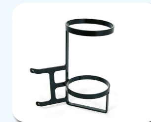
B83 - Canister holder