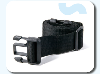
B20 - Safety belt