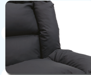
- Leg compartment -