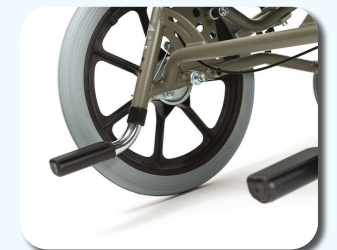
B77 - Anti-tipping