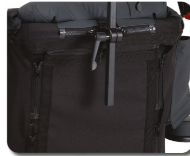
Easy removal of the compartments by means of a zipper