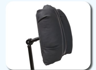
L58G - Comfort headrest