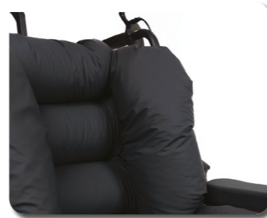
Each compartment features bead-filled cushions that provide optimum body & contour support. - Chest compartment -