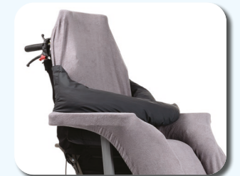
B54 - Cloth