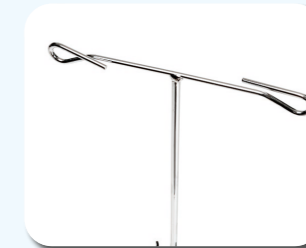
B52 - Serum holder