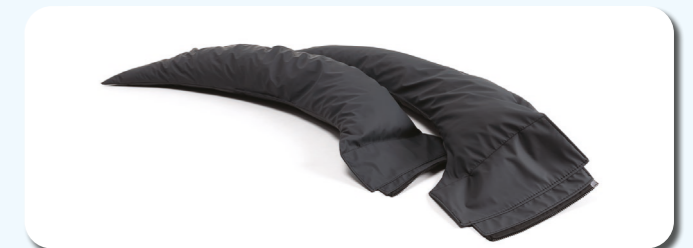
L71 - Granulated removable armrests