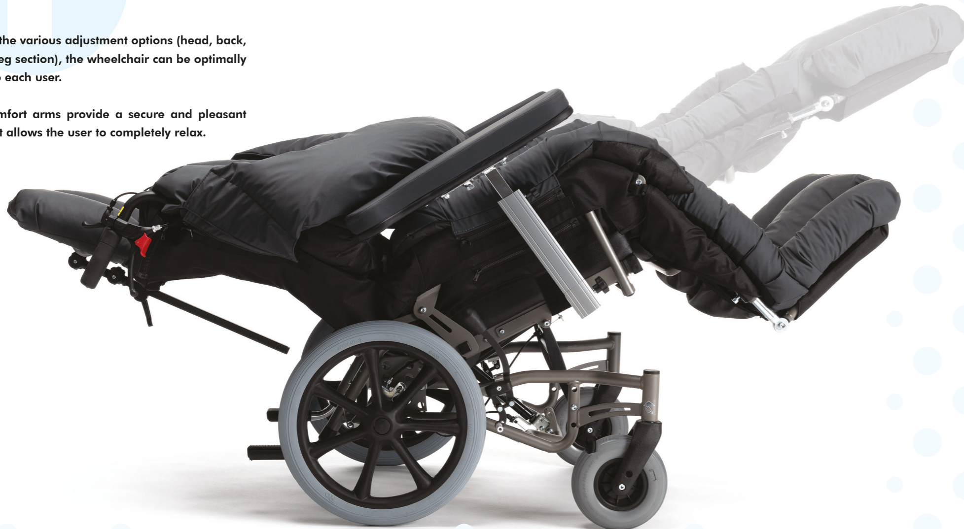
Change to a personalised resting position thanks to the independent adjustment possibilities of seat, back rest, feet and legs.

⊕ The comfort arms provide a secure and pleasant feeling that allows the user to completely relax.